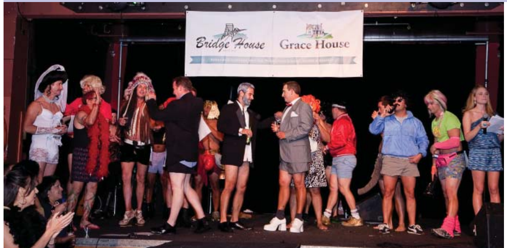
Mr. Legs Contestants on stage at Generations Hall